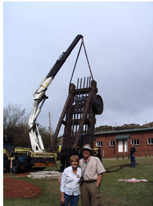
Refurbished stamp battery, used to crush gold-bearing rock