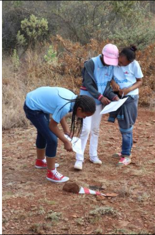
Nature Treasure Hunt