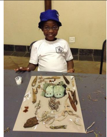
Art from nature