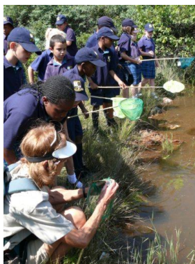
Guided walk: Explore & discover