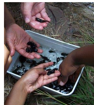
Carefully touching tadpoles