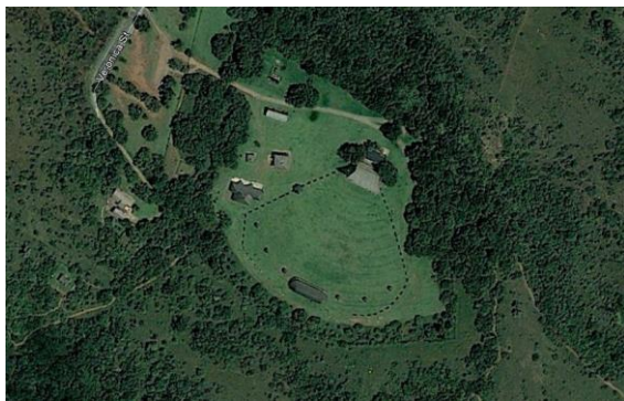
Google Earth view of part of Kloofendal Nature Reserve

Teachers can request curriculum relevant topics to be explored with learners.