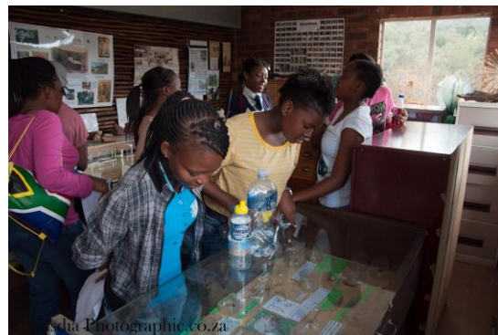
Friends of Kloofendal (FroK) Environmental Education Centre