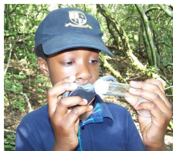
Using magnifying glass to examine insect in sample jar